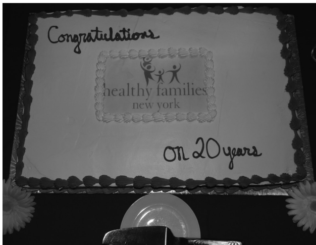
Celebrating our 20th anniversary

HFNY programs and members of the state Central Administration Team celebrated 20 years of HFNY at the NYS Child Abuse Prevention Conference