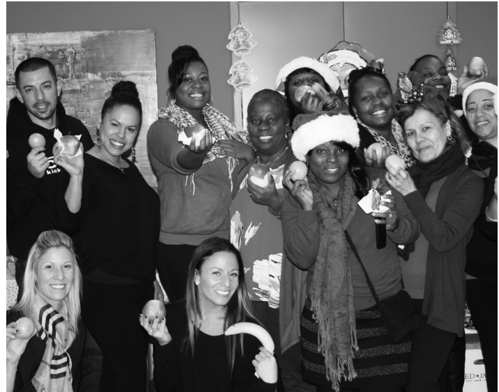
CAMBA's holiday celebration

First of all that it's still here and going strong! I would also like to see it expand culturally; there are so many other cultures and languages we could be reaching. I would really like that.