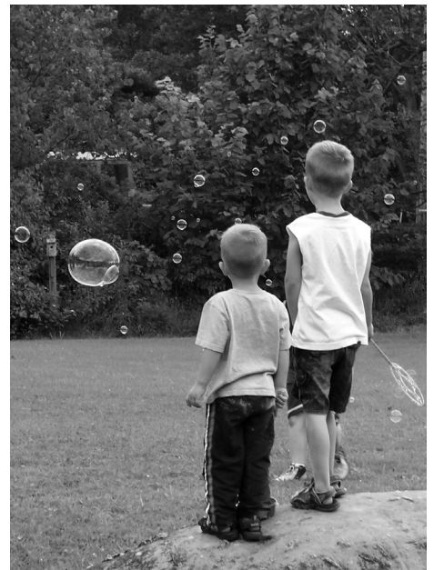
Boys and bubbles at Starting Together Picnic

However we have not done this alone. Our success is due to the partnerships we’ve developed and the support we receive from our community partners; from OCFS and PCANY; from the families who give us a chance, commit to the program and offer us ideas and feedback, and from our very dedicated Program Supervisors, FAWs and FSWs.