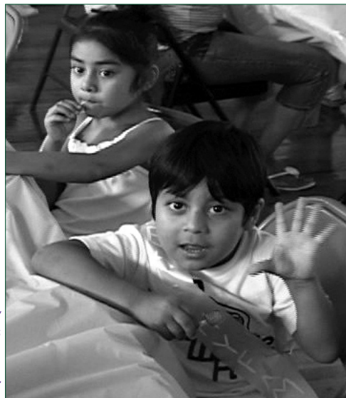
Completion Ceremony for Morris Heights Healthy Families, The Bronx, June 9, 2007