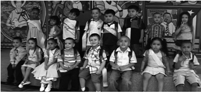
Completion Ceremony for Morris Heights Healthy Families participants was held on June 9th, 2007