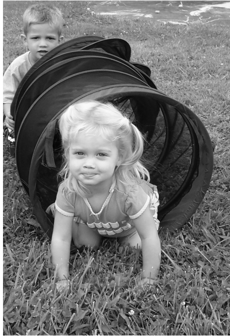
Fun at the Starting Together picnic

Supervisors; 7 FSWs (HFNY only); 6 Sr. FSW’s (4 have 50% HFNY and 50% EHS caseloads; 2 are 100% EHS); 2 FAWs; 1 Father Involvement Specialist; Program Assistant (Data Entry) and a Child Development Specialist.