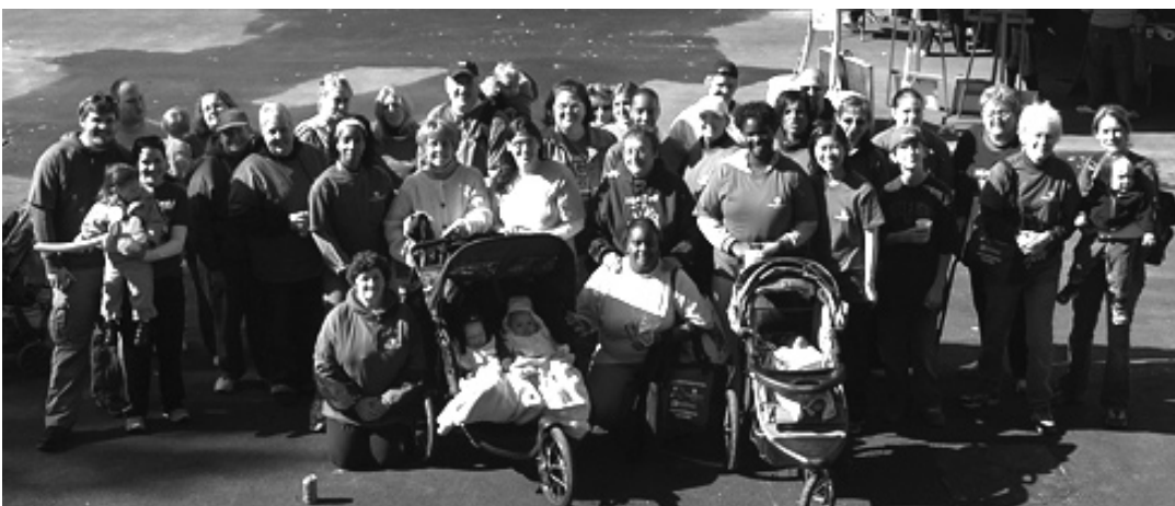
Healthy Families of Rensselaer County 2007 PCANY Walk for Children