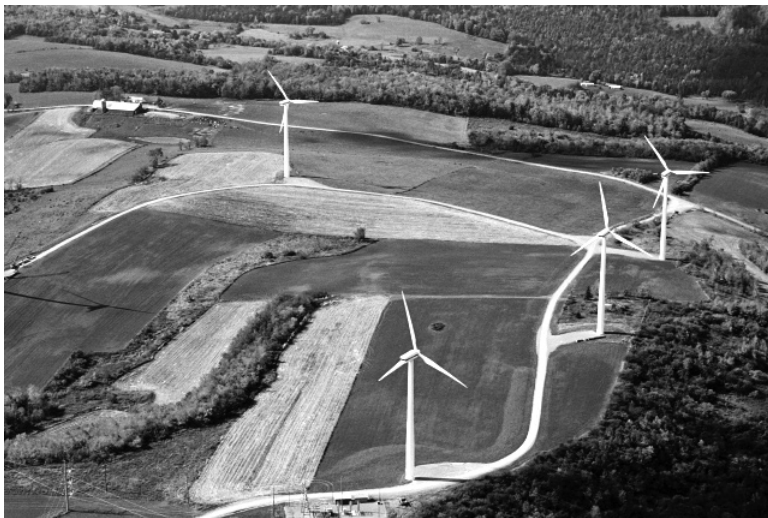
Wind Farm, Madison County

"My Family Support Worker always listens to everything I say, especially concerns I express about any situation I am having. She makes comments and gives information (facts) relevant to the situation that does not reflect her opinion at all. This is frustrating because I just want an answer of what it is I should do in the situation. I however appreciate that she does this because it allows me to sort my pros and cons in the conversation with her while receiving facts to help justify my concerns. I think it is very important that she gives me the facts and helps me to look at all angles of the situation without her being opinionated. This has helped me through many tough situations. I look at all of the angles with lots of facts to make my own decisions that are the best for my family."