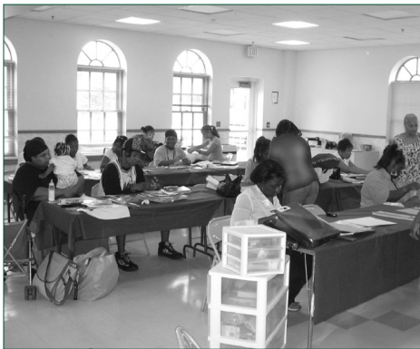
Scrapbooking with Parent Support Group at Buffalo Home Visiting